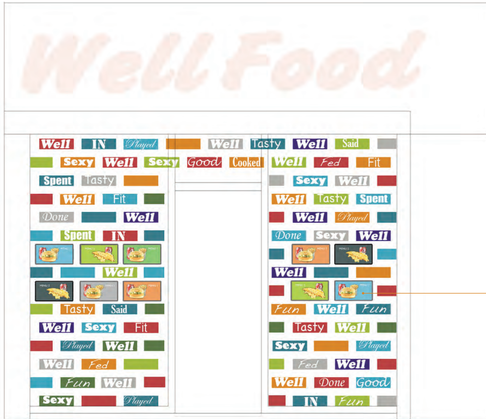
1:20 Elevation of Shop Front

Brick orientation reversible so messages conveyed to diners